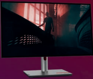
ThinkVision P27h-30 Monitor