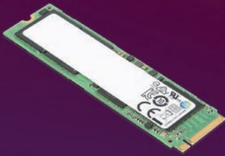
2TB Performance PCIe Gen4 NVMe OPAL2 M.2 2280 SSD