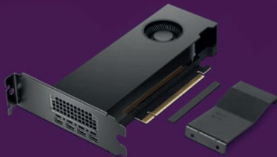
NVIDIA RTX™ A2000 Graphics Card